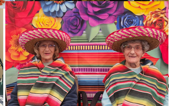
CINCO de MAYO