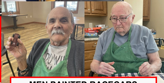
MEN PAINTED RACECARS